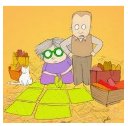
"Laying out a quilt top over the mess doesn't count as spring cleaning."